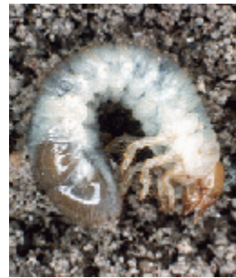
Japanese beetle larva.